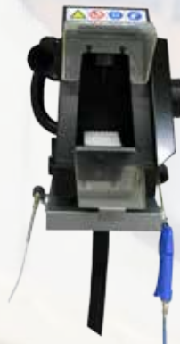
Drester QR-20 for Solvent