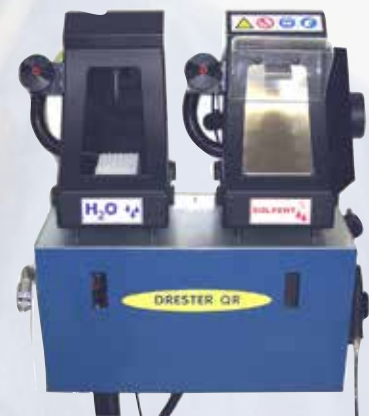
Drester QR-TT for Water and Solvent

The use of disposable cups has increased rapidly in recent years and it keeps growing quickly. When using disposable cups, money and time could be saved if you take advantage of the benefits.