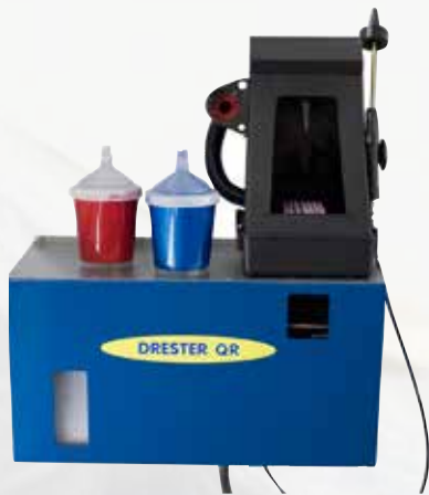
Drester QR-10 for Water