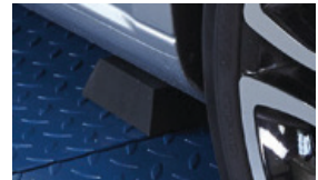
Truncated pyramid pad