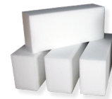
Polymer pads 100 x 150 x 340 mm