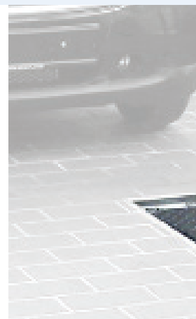
In-ground or above ground installation