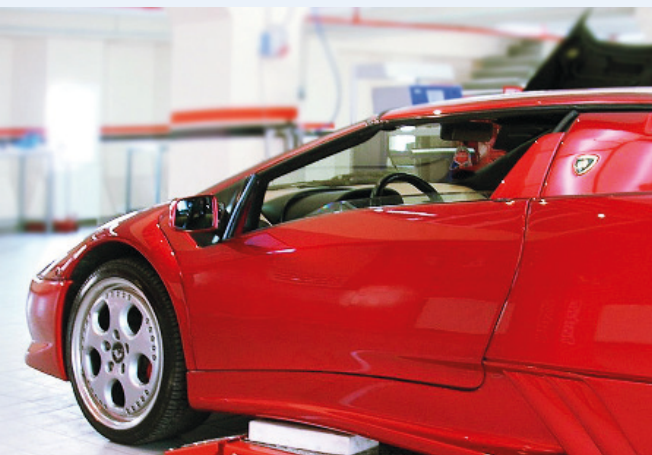
Very flat construction: Perfect for sports cars

JUMBO LIFT NT 3200, 3500, 4000: WE OFFER THE RIGHT CAPACITY FOR ANY WORKSHOP