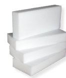
Polymer pads 50 x 150 x 340 mm